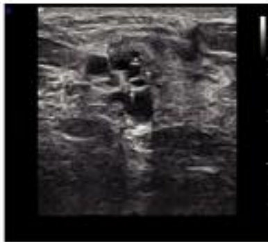
B-Mode Benign Breast Cysts